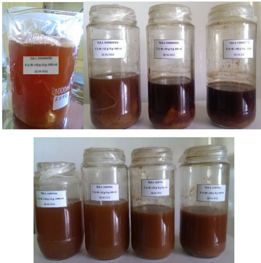
FIGURE 1 Fermented samples (from top left to right): Tea 1–F, Tea 2–F, Tea 3–F, Tea 4–F; control samples (from bottom left to right): Tea 1–C, Tea 2–C, Tea 3–C, Tea 4–C

of the tea with the tea fungus, 1 day after the fermentation, followed by weekly analysis for a total period of 8 weeks. With the exception of the weight of the tea fungal mat, all other parameters were measured in the broth of the fermented samples.